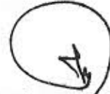
Executive Engineer Division No II, JDA Jammu