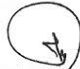
Executive Engineer Division No II, JDA Jammu